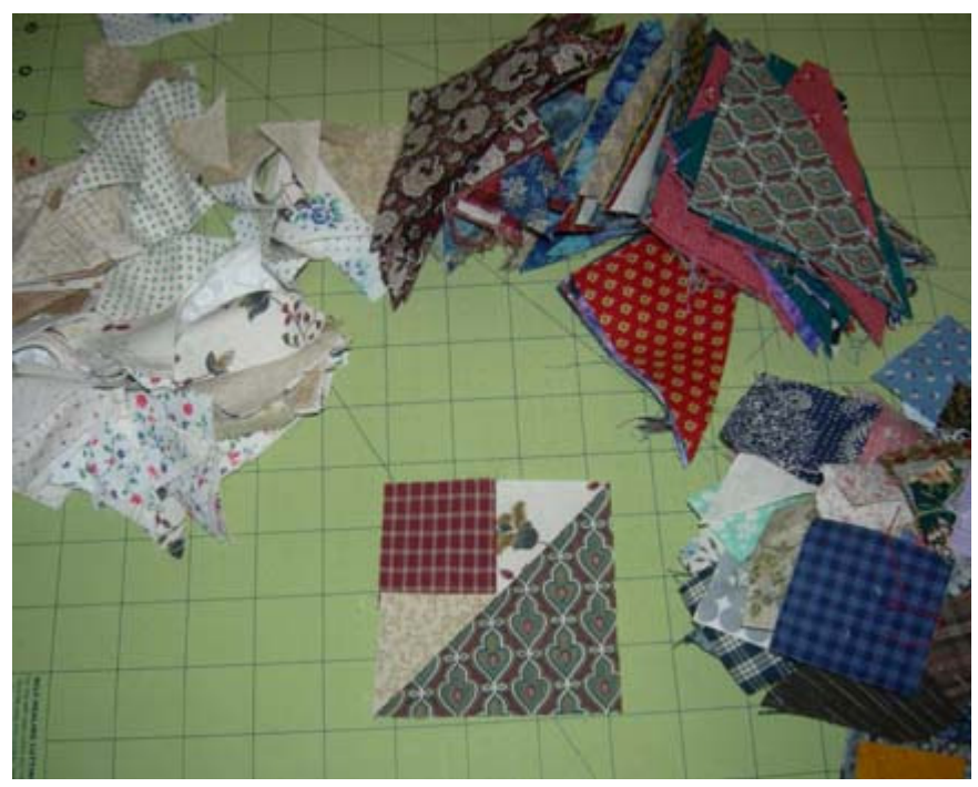
A Quiltville Mystery Quilt! ©2008 Bonnie K. Hunter. All Rights Reserved.