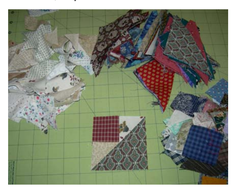
Have fun sewing your 142 half four patches!

seam allowance. Sometimes you just gotta, right? I use the edge of the base triangle against my seam guide...and when I am done sewing, the seam might be a bit less on the pieced triangle, but when pressed, it comes out RIGHT. I also don't square up my units after they are pieced. If they are pieced right, they shouldn't need squaring. If something is an 1/8" short...I figure it's got give in it. The quilt police might shoot me, but fabric is a semi-fluid medium. It gives, it stretches, it eases, it's like trying to sew through mercury! If I were working with stained glass or tiles..it's a bit different. You cut it a size, it stays a size..but fabric ...well...it's ALIVE!