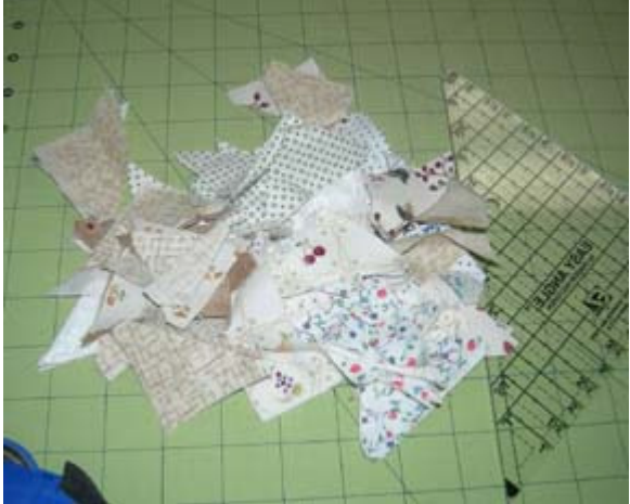
Then, get into your bin of 2" light strips (or cut some if you don't keep them on hand)and do the same thing....stack some up, get a clean cut on one end, and start cutting triangles using the 2" measurement on the ruler. ou are going to need 284 'wing' triangles all from lights.

If you haven't taken the jump to acquire the easy angle ruler yet, I have uploaded a pdf file of the regular rotary cutting instructions here: <a href="http://quiltville.com/pdf/split4patch.pdf">http://quiltville.com/pdf/split4patch.pdf</a> Instructions for cutting one block unit are given. Make 142 split four patch units!