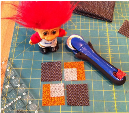
Directions make 3" finished bow tie blocks!

From cheddar background cut: (2) 2" squares.