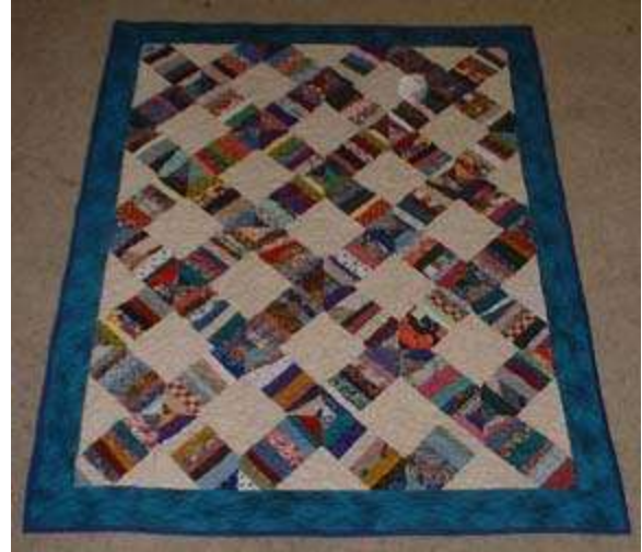
And one I made to gift-away.

Do you feel a need to serve someone in your life but don't feel you can reach very far from within your own walls? THINK AGAIN! You can brighten up the world of a child far away!