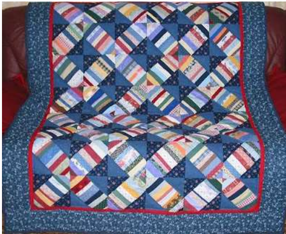
And another set in blue!

One of my favorite causes is making quilts for children.