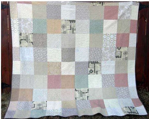
I used up lots of 10.5" squares of neutrals in a fun pieced backing that cleaned out a lot of stash I didn't want anymore!

If you loved this pattern, please check out my other designs found in the Quiltville Store where my books (paperback) notions, tools, and other goodies along with my digital patterns are found right at your fingertips at Quiltville.com/shop.html