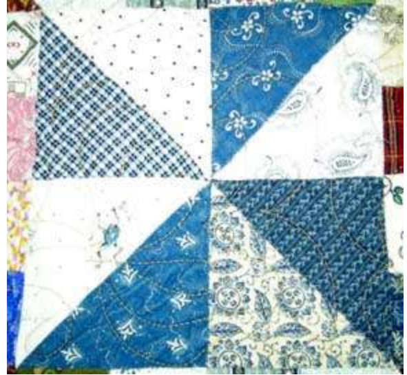
Version 4: all blades from the same color family, but all different fabrics!

Doing pinwheels this way added to the "vintage" feel of the quilt and helped me use up every triangle pair I had cut!