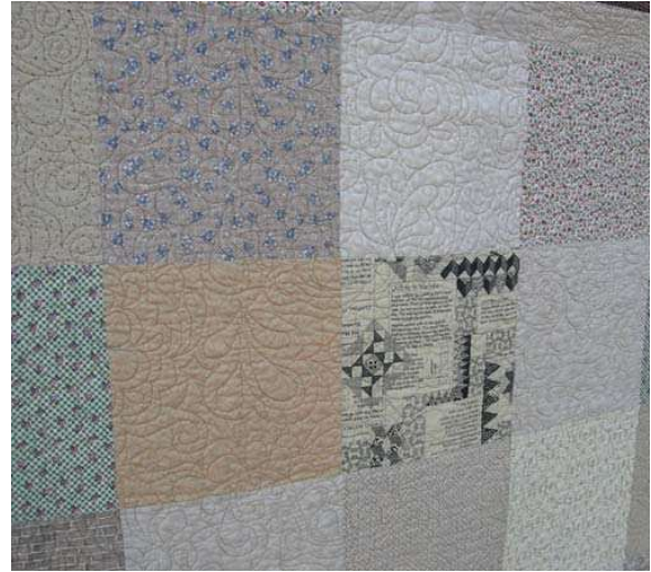
Close up of backing and quilting design!