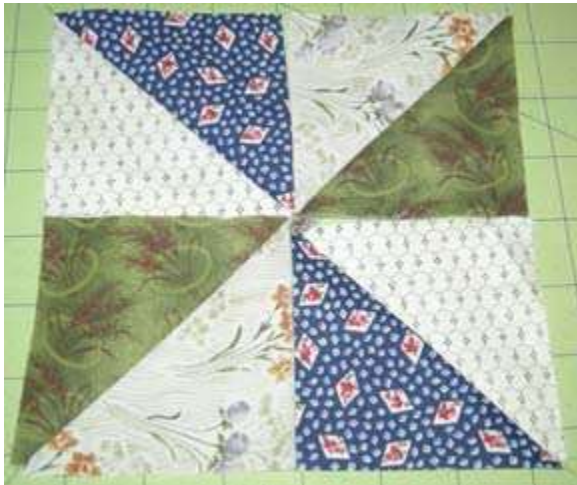
Version 3: two pairs of blades!