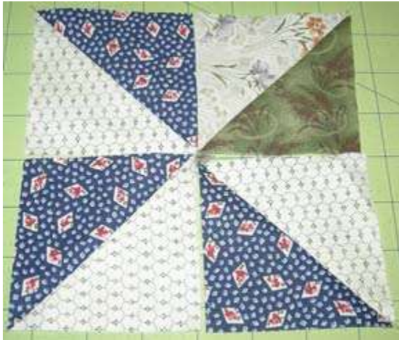
Version 2: 3 blades the same, with one "maverick" blade!