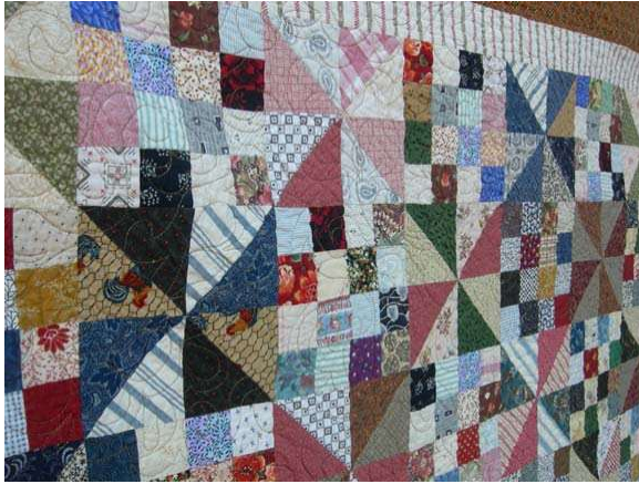
Close up of piecing and quilting! You can really see here how the different rows have pinwheels going opposite ways!