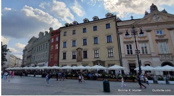
Old Town Krakow, Poland

I was traveling with a fabulous group of quilters, spouses and friends to Poland in September 2023. It was my first time, and I was enchanted by the beauty as well as haunted by the history. I think we need to see and understand BOTH to really appreciate this marvelous country.