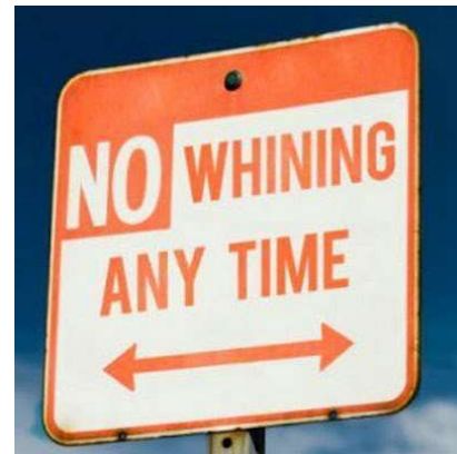
What's my number 1 rule?