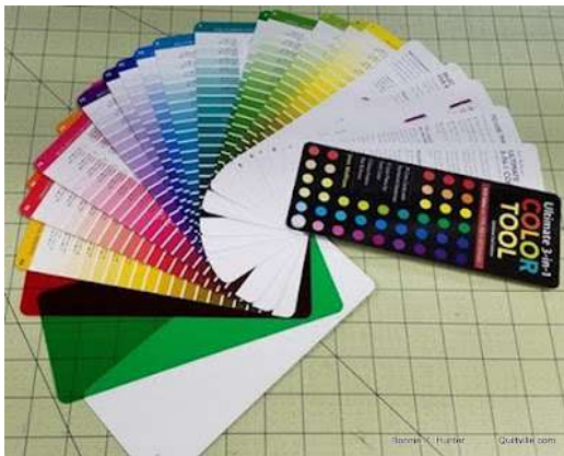
Ultimate 3-in-1 Color tool.

I love this tool for helping with color recipes that WORK! If you don't want to sew with my 3 colors – this tool will help you choose what goes with what in a very simple way.