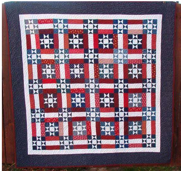
Finished Jan 5, 2006 Size: 69"X69"

"Let every Nation know, whether it wishes us well or ill, that we shall pay any price, bear any burden, meet any hardship, support any friend, oppose any foe to assure the survival and the success of liberty." ~John F. Kennedy