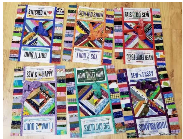
And then there were six!

Trim the edges of the pages and cross-cut into 2 1/2" strips. Remove paper. Join the strips end to end into one long length.