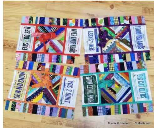
Four with prepared bindings!

Short strips can be joined end to end and used as one long strip across the page. USE EVERYTHING!