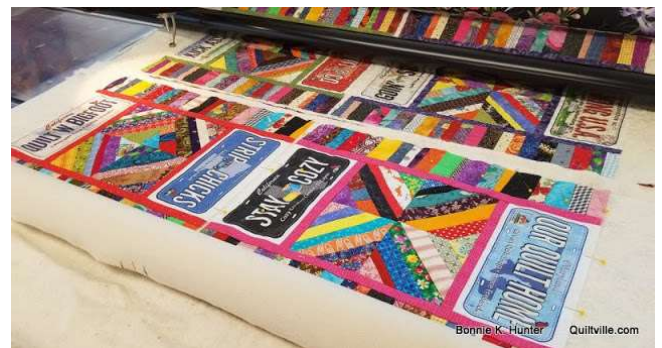
Mass quilting on the long arm!

I also found it helpful to avoid bulk at the ends of the borders by pressing the last seam on either end toward the center of the border.