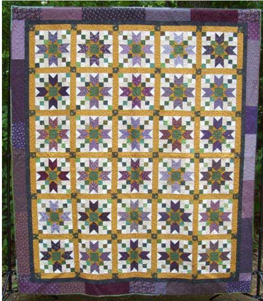
12" block, quilt size approx. 82"X95"

Jared Takes A Wife is based on the traditional "Blackford's Beauty" block. It is a great block with no inset Y seams and can be made completely from 2" strips and squares.