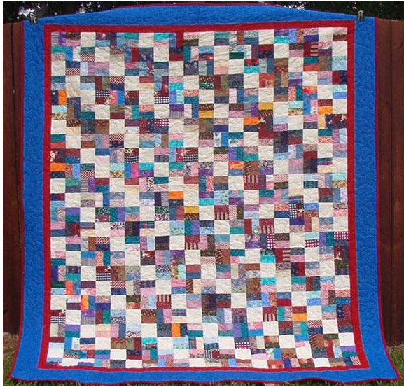
Block size: 12"

©2005 Bonnie K Hunter. All Rights Reserved.