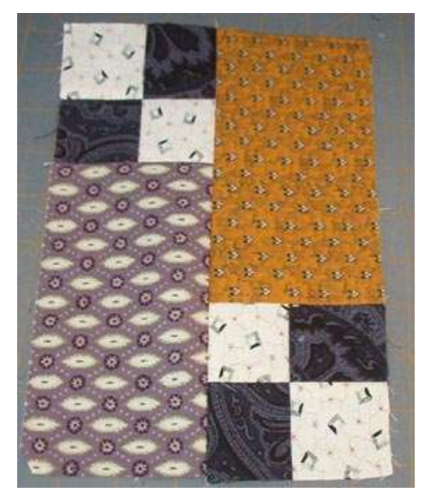
This is your block unit! It is NOT a square, it is a rectangle made of two 'matchstick' units. This unit will measure 6 1/2" X 9 1/2" amd finishes at 6" X 9" in the quilt.

Take your stack of matchsticks, and divide it in half, flipping one half the other way. Lay them out as shown, one pile with the four patch at the top, and one pile with the four patch at the bottom. Sew these right sides together and press towards one side. The only thing I watch for here is that I am not sewing two blues together, or two reds together, etc... otherwise, it is completely random!