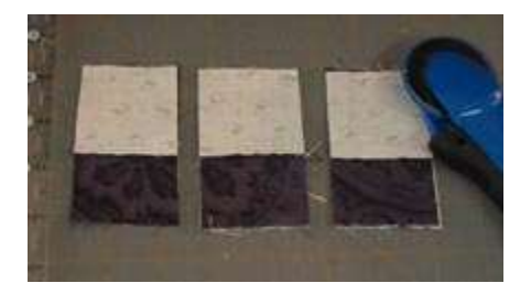
Then I flip one of the half strips over so that the seams are opposing!

towards the dark and cut it in HALF along the fold.