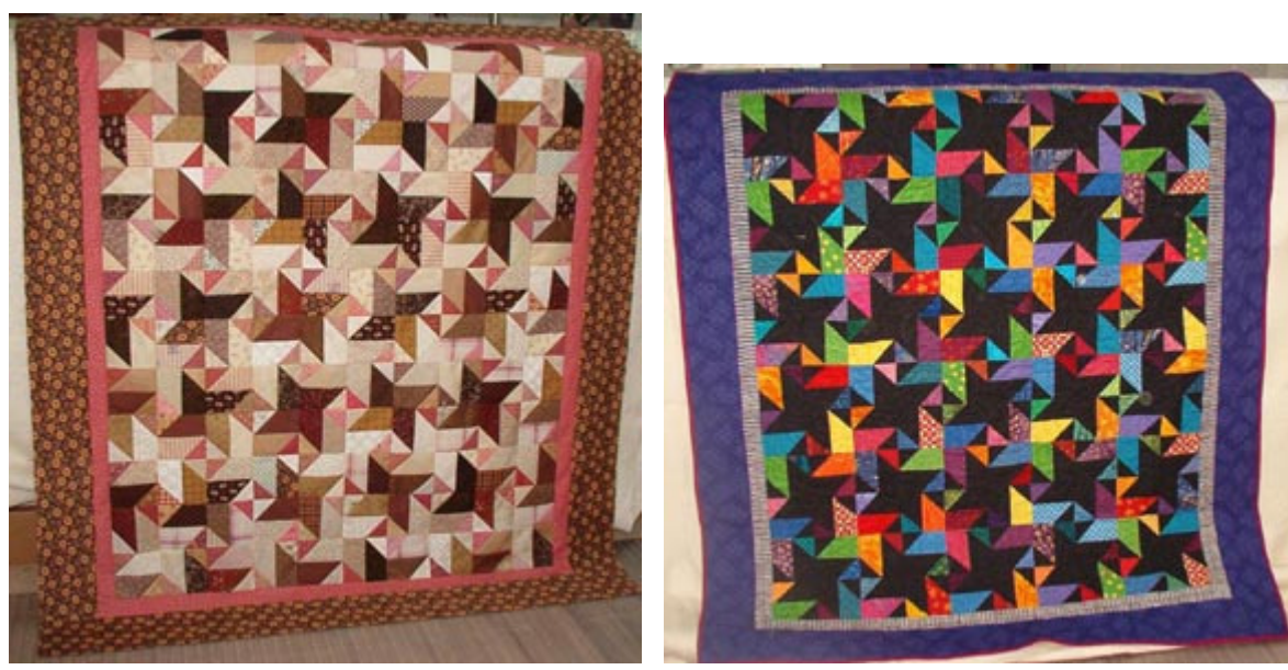
For a LAP size (shown)...try doing 30 blocks set 5X6!