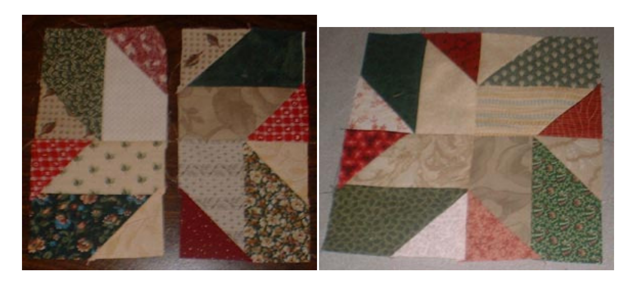
Finished blocks look like this!

Then...pair up and stitch the block halves into complete light star blocks like this! The only rule I used was trying to not put two of the same lights or darks next to each other.