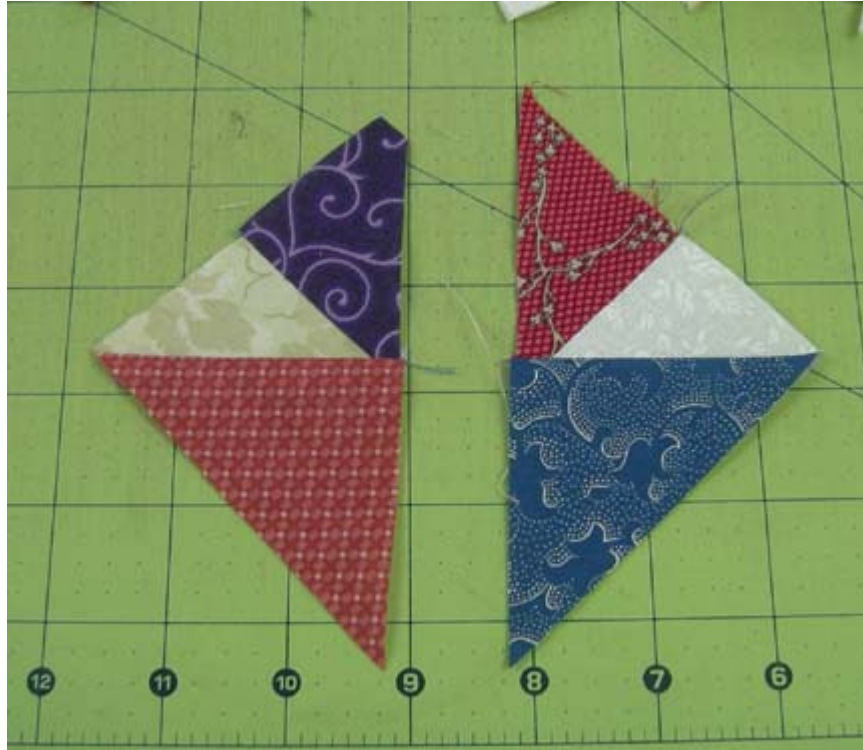
Half Split 4 patches!