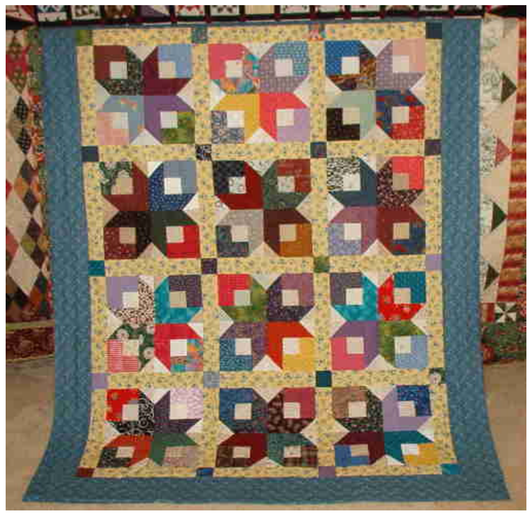
I made 12 quick star blocks for a bright and fun snuggle-sized charity quilt.

This one is designated for the Palmetto Breast Cancer Center. I think it is a good size for that cause as it finishes at 54"X68".