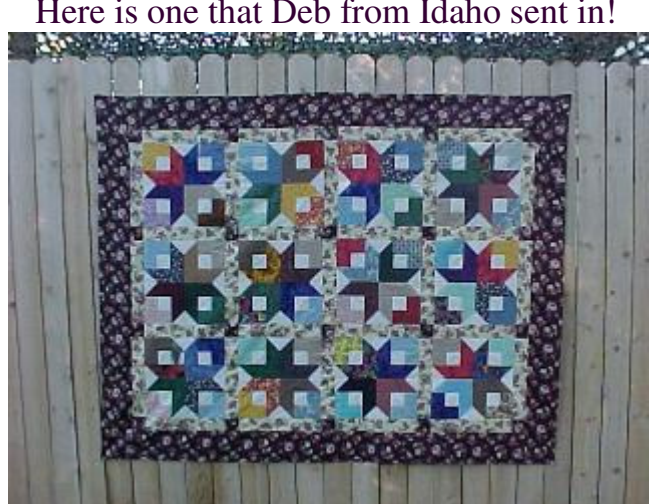
Here is one that Deb from Idaho sent in!

If you make this quilt, I'd love to display your picture here to show more variations!