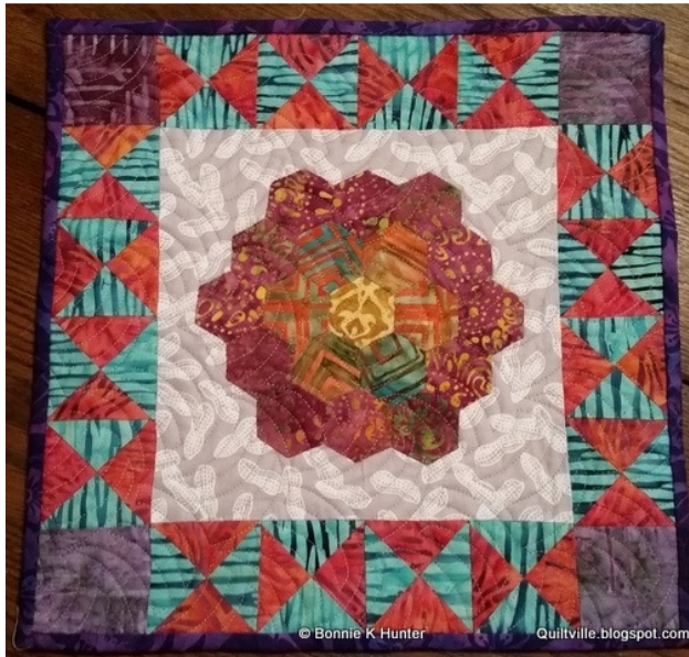
A Quiltville Mini